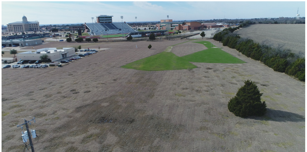
7.25 Acres Looking West