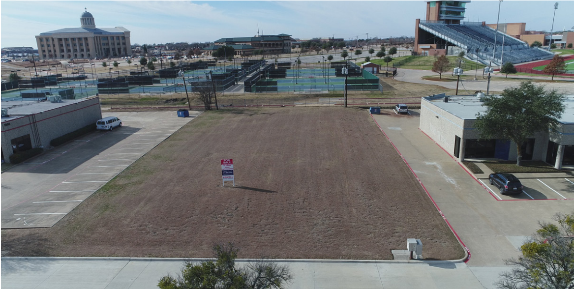
7.008 Acres Looking West