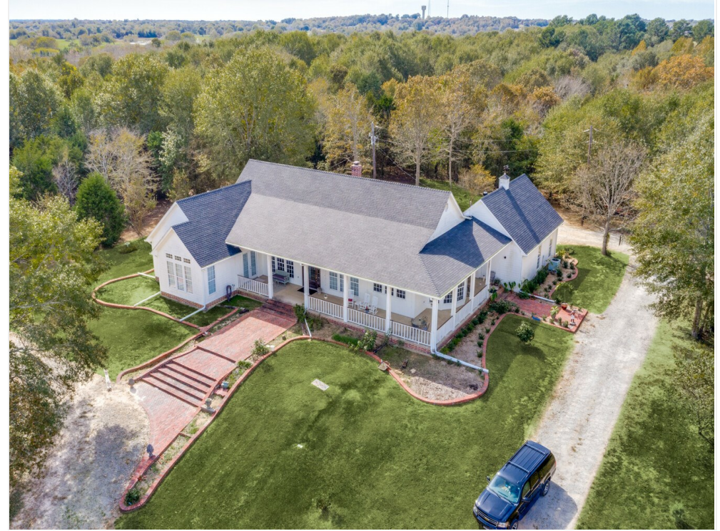
House on West Tract