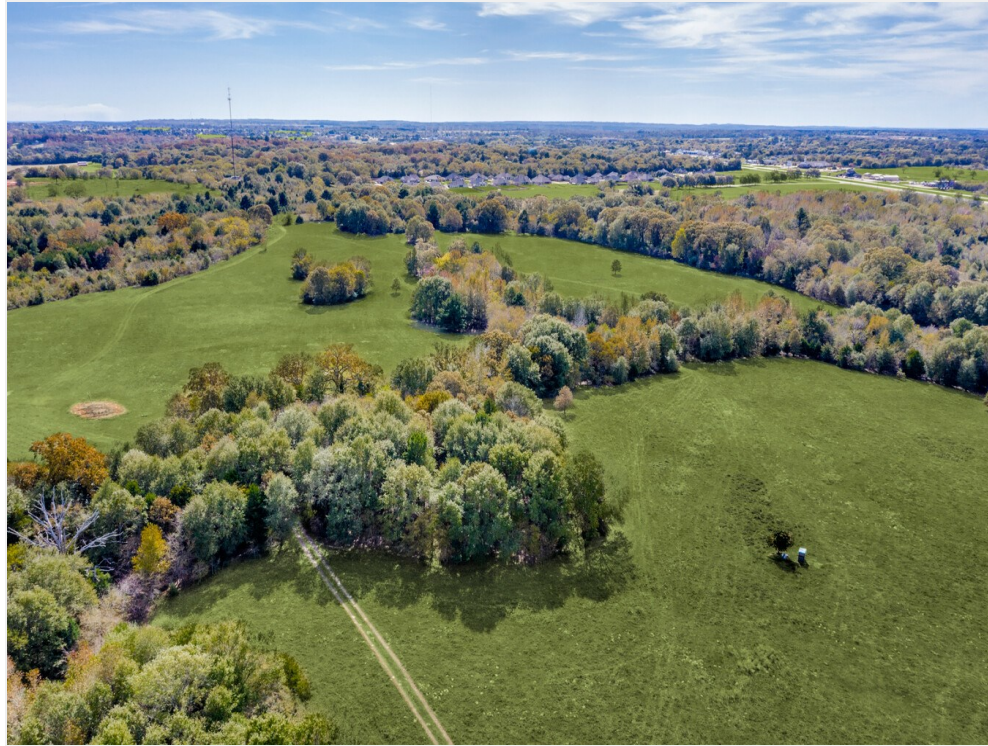
East Tract 240 Acres 2