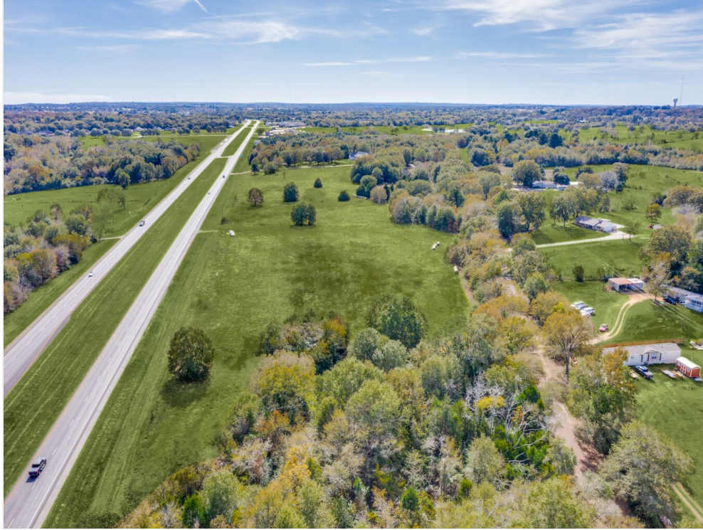
West 34 Acres