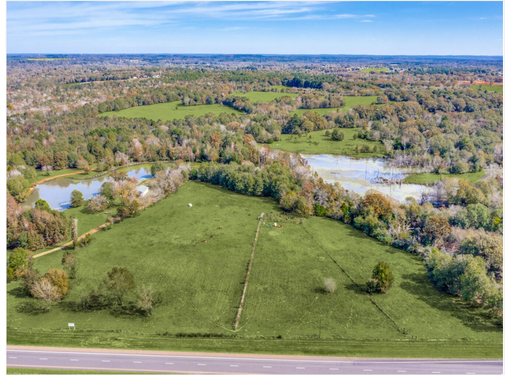
East Tract 240 Acres 3